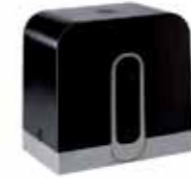
230 Vac motor

The guiding post is standard equipped with a flashlight. Additional fence connections allow rigid connection of the Tempofor fence to the gate.