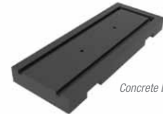
Concrete base Tempofor gate

The complete assembly, gate and concrete base, can easily be moved by forklift. Anchor points are foreseen in the concrete base for a steady fixation to the ground.