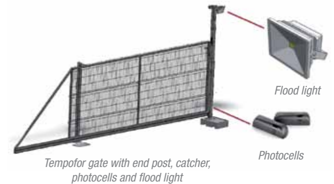
Tempofor gate with end post, catcher, photocells and flood light

Finally a high security magnetic switch can be added to control the status of the gate.