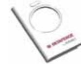
Betafence remote control